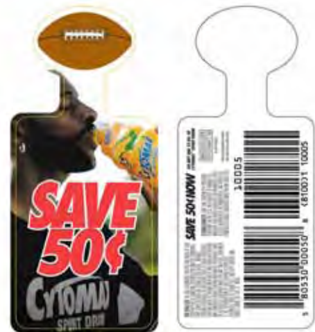
Rather than change its entire label each time a promotional opportunity arose, Cytomax and Label-Aire created a solution that permitted neck hangers to be applied as part of the packaging line.

pace of the line. This particular facility didn't have the equipment that would allow us to apply the neck hangers so we had to do it manually. We had production workers lined up along the assembly line and they would try to apply the hangers as the case came off the line. It takes enormous dexterity. They weren't being put on consistently and it was comical, quite frankly. We never got all of them on a full case. It was really hit or miss and we decided we weren't going to do it again this way. The Langer's team did the best they could, but without a neck hanger applicator, it proved too difficult.