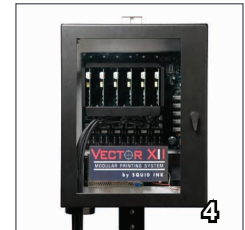
1) Users can run up to 12 lines of print from a single controller.