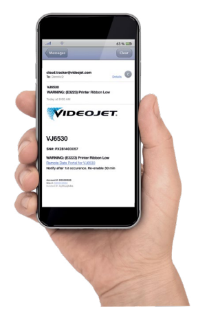
* Subject to availability in your country