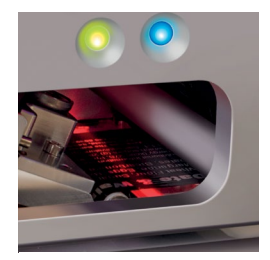
Videojet iAssure™ technology, a built-in code quality checker helps reduce waste and rework