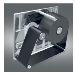
Up to 1,200m ribbon capacity, providing more throughput between ribbon changes